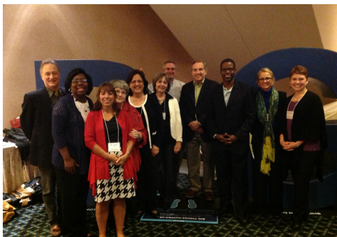
Forsyth County Team at National StriveTogether Convening (September 25-27, 2013)

For more information or questions about the Forsyth County Cradle to Career Partnership, please contact: